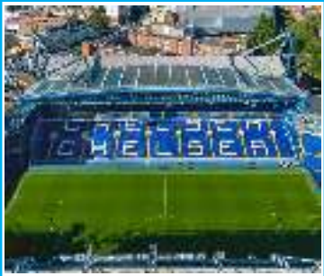
CHELSEA EMPLOYEE ADMITS £200,000 CLUB FRAUD