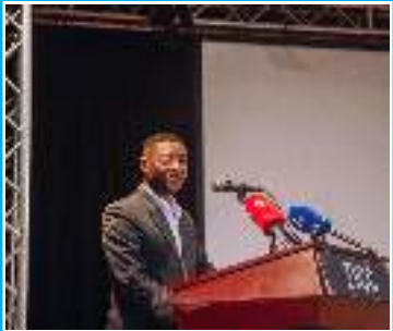
FOOTBALL STAKEHOLDERS CHART NEW PATH FOR ZAMBIA'S GAME AT NATIONAL INDABA