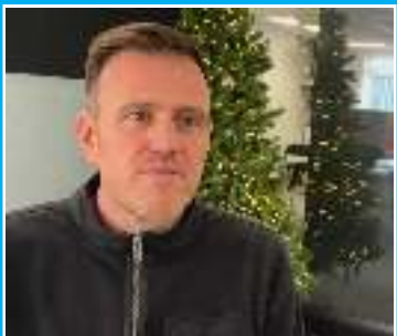
OPPORTUNITIES MISSED OVER YOUTH JOBS, TRAINER SAYS