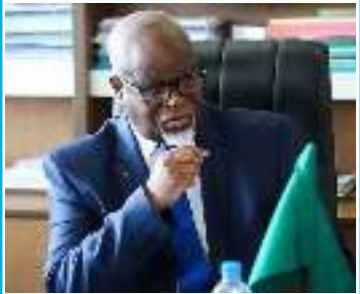
VOLUNTEER DOCTORS THREATEN TO DOWN TOOLS OVER DELAYED RECRUITMENT