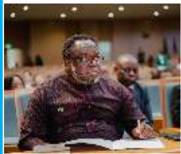
MPIIKA CLOSES CHAPTER ON INFORMALITY AS ARTISANAL MINERS GRADUATE WITH LICENSES